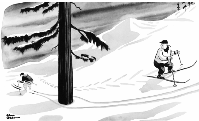
(c) 1940 Charles Addams, Renewed 1967. With permission Tee and Charles Addams Foundation.

Deadline for Submissions: December 1, 2016